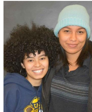
A friendship formed through Berkeley Connect.

The benefits of participation are clear. Previously reported research shows that participation in Berkeley Connect correlates with higher grade point averages and higher retention rates for transfer and underrepresented minority students (see details at www.berkeleyconnect.berkeley.edu/impact-of-berkeley-connect/ ). URM students who've received the Berkeley Connect message "you belong here" are half as likely to drop out in their third year as those who did not.