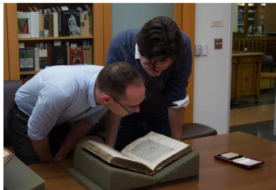
Exploring the riches of the Bancroft Library collection.

Many students at UC Berkeley feel anxious about approaching their professors. One Berkeley Connect alum wrote: