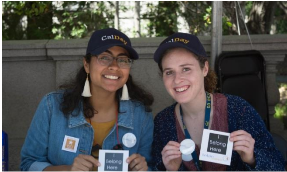
Berkeley Connect student volunteers spread the word.

Each semester, Berkeley Connect helps over 1000 undergraduates at UC Berkeley build confidence and community by pairing them with graduate student mentors and placing them in small groups with peers who share their interests.